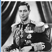
King George VI

The war began in 1939 and was officially over on 8th May 1945 World War II began Germany invaded Poland and would not withdraw.