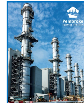
UK's largest power station Wales