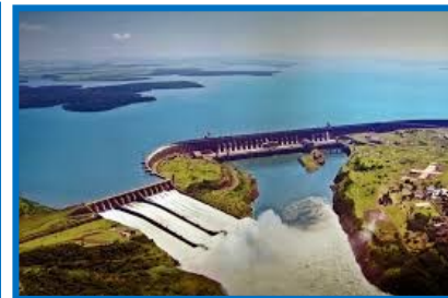
Itaipu Dam Paraguay