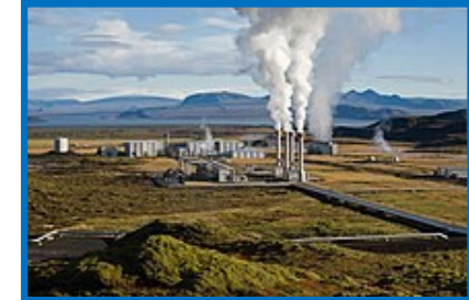
Geothermal Power station Iceland